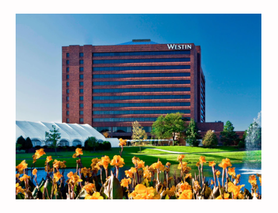
Wi-Fi is available through the hotel for a fee.

All conference activities will be held at the Westin Chicago Northwest. A block of rooms has been reserved for ICB conference participants at the hotel for the conference rate of $140, plus all applicable taxes, per night. Please make your own reservations by contacting the hotel directly at 630-773-4000. Be sure to identify yourself as an ICB conference participant to receive the special group rate. Reservations must be made by February 27, 2023. After this date rooms may be reserved on a space-available basis only at the customary rate.